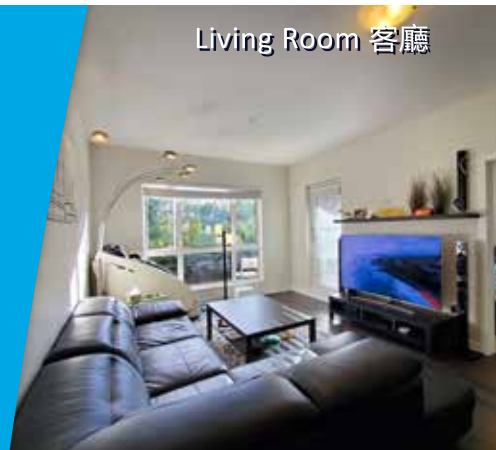
Living Room 客廳

Riva 3期寬敞兩臥室，自帶大露台，現代化的裝飾，包括緩衝式開合木製櫥櫃，優質不銹鋼用具，複合石材檯面，舒適的中央冷暖氣。位於規劃中的水濱公園旁邊，靠近水濱步道，列治文奧運會館，加拿大超級市場，大統華，醫院，火車站和Lonsdowne購物中心，以及酒店。小區內有12,000平方英尺設施，包括健身中心，室內泳池、按摩池、桑拿及蒸汽浴室。1個停車位和1個儲物櫃。