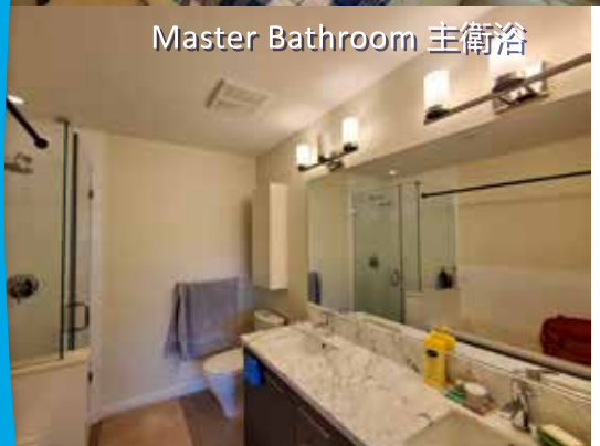
Master Bathroom 主衛浴