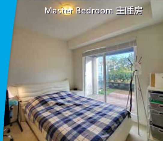
Master Bedroom 主睡房